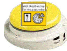
Big Mack www.ablenetinc.com